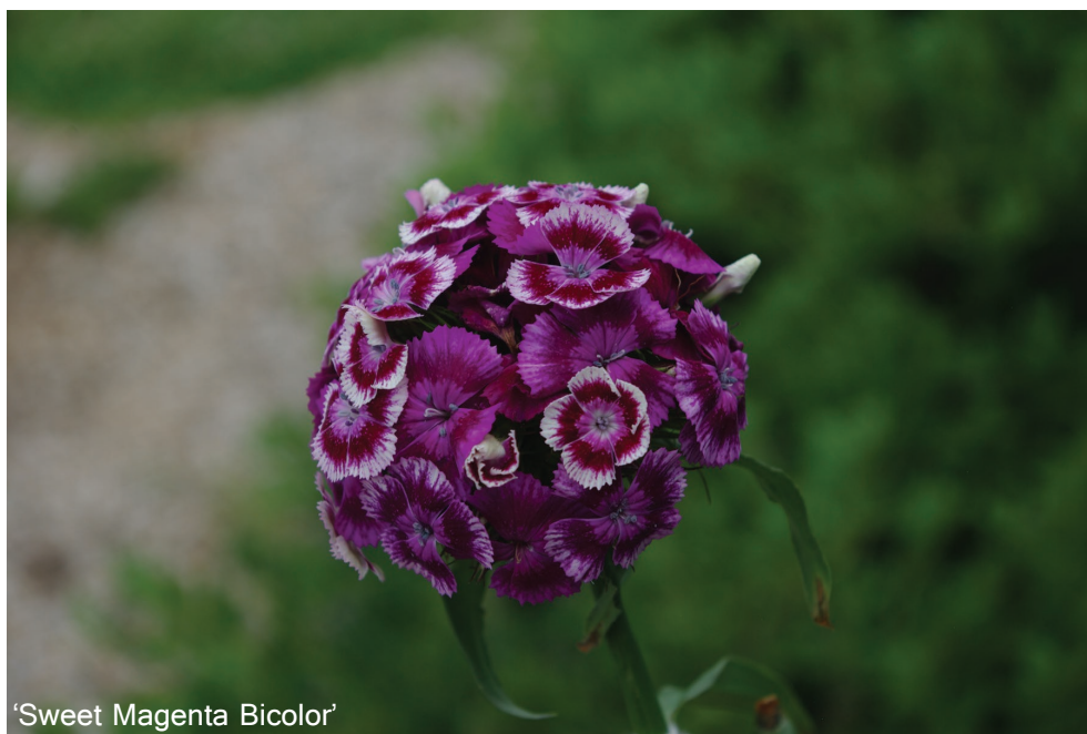
'Sweet Magenta Bicolor'

Comments: It was hard to arrange with and not good for bouquets; We loved this for wedding work, with the trending soft pink colors we used it consistently in bouquets, crowns, and corsages, the colour and delicate nature offer desirable additions, also the germination was excellent! as some delphinium can be stubborn these seeds were easy to start, very healthy and vigorous, we do not use irrigation in our annual field and I feel that if they were grown in a hoop or irrigated field the stem length would be much better, we had a dry mid June till mid July which limited stem length, as we received more rain the stems were longer, also they had a long bloom window, and continued to bloom for us for at least 8-9 weeks, very branching but did not require netting, I started some a few weeks later as well, found the first planting produced more stems, the second planting had one nice flush again with proper irrigation, there is potential for succession plantings, I also grew the 'Planet Blue' purchased