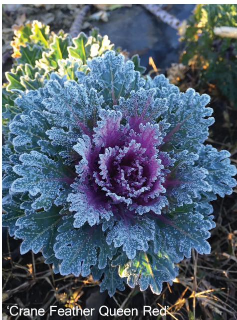
'Crane Feather Queen Red'

Many comments were made about replacing the bucket water periodically for kales. If not, the sulfury compounds released from the decaying foliage will definitely get your attention. Think of kale as "smart" cut flowers—they let you know when their bucket water needs to be replaced!