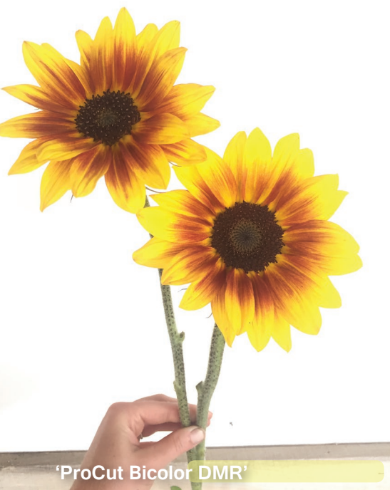
'ProCut Bicolor DMR'

Besides the three cultivars already discussed, four other commercially available sunflowers were in the Trial, and while not groundbreaking, both 'Vincent's Choice Deep Orange DMR' (Sakata) and 'ProCut Orange Excel' (NuFlowers) scored very well. Both had the classic dark centers and orange petals that many customers tend to prefer.