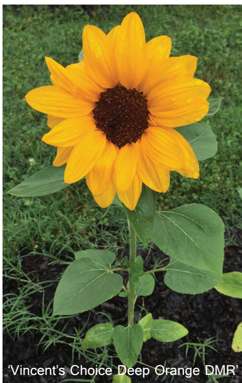
'Vincent's Choice Deep Orange DMR'

Problems: None (2); Floppy, weak stems (3); Short shoots (3); Stems were not quite as strong as single-stemmed varieties, tended to nod in the vase, we prefer single-stemmed for bouquet production due to ease of harvest and programmability; Took a very long time to grow and produce flowers; Pollen; Too branchy, not a great cut for us; Postharvest was tricky, some did well while others wilted; the first blooms were beautiful, and I had a ton, but as the plant continued to bloom, the flowers did not look as robust, plus I think the bugs discovered them, the period