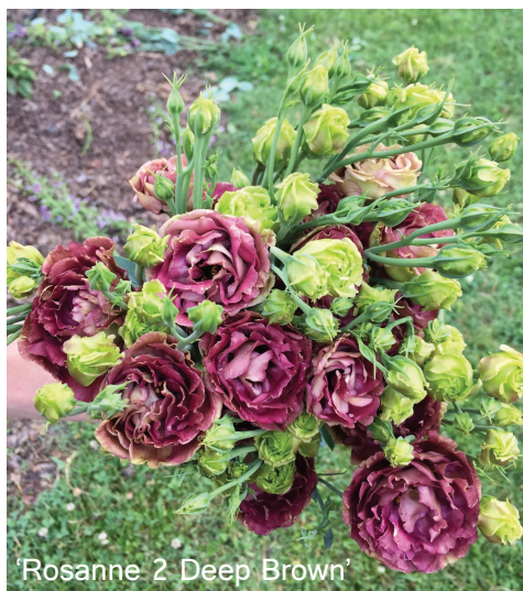
'Rosanne 2 Deep Brown'

Problems: Short stems (2); Fair germination, weak seedlings, small blooms; Slightly weaker stems than the other cultivars in this series, rain damage was apparent in the field; Wish it had more petals, needs better presentation; Not marketable in bulk to florists, sold well at farmers' market and in mixed bouquets; Not as productive as other lissies, including other Roseanne series, not as tall as other Rosannes, green color didn't seem to be popular with our brides this season (however, we'll definitely grow again and hope for a different color trend!).