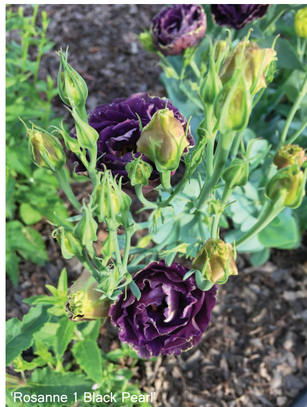
'Rosanne 1 Black Pearl'

found the late sowing this year to be the easiest, I did not net, nor add fertilizer other than compost application in June, no irrigation, no chemicals of any type were applied, the last planting was definitely most beneficial to us, we did not need to net or strip stems prior to harvest, insect damage much less, stem size much smaller which is more desirable in a mixed bou-