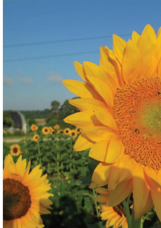
Sunflower 'ProCut Gold'

Good Qualities: Bright and sunny yellow color with a dark center (9); A vibrant, sunny yellow vs. more traditional "orange" suns like 'ProCut Orange', 'Sunrich Orange', etc.; 4½-5" blooms; Shape; Early blooming, medium sized flower; Probably my favorite ProCut, very consistent bloom and harvest time, also harvested in October in about 48