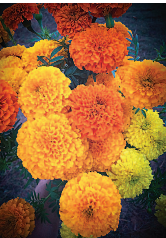
A sampler of marigold varieties in the 2015 Trials