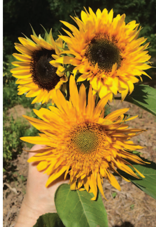
Sunflower 'Starburst Greenburst' (front) 'Procut Brilliance' (left) 'Starburst Panache' (right)