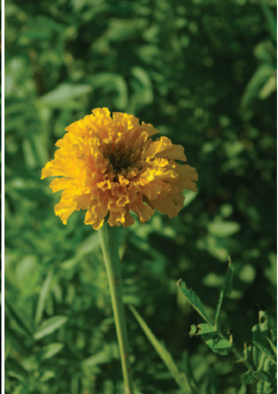
Marigold 'Gold Storm'

long stems, multiple blooms that were large broke easily; Japanese beetle damage; We had fungal problems with all our marigolds; Need support netting - plants fell over; Compared to 'Giant Orange', it was weaker stemmed and had less blooms; Susceptible to fungus.