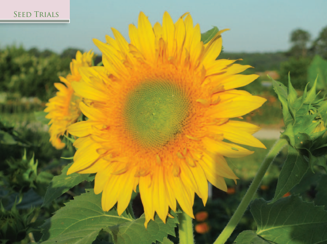
Sunflower 'Starburst Greenburst'

six to eight inch spacing, the earlier plantings produced several side shoots developing just before the main stem was harvested, these sides were about 5-9" average, I will probably grow again but a limited amount and only 2-3 sowings aiming for a mid Sept, early Oct and mid Oct harvest, July 16 planting we harvested Sept 21, planted twice earlier but honestly did not harvest as they were not what people wanted during the summer months, I like these better than the similar shade of ProCut; We had a lot of deformity problems with our sunflowers this year; Flowers were small-about 2.5 inches in diameter; We hate bicolors and liked this one!!; Made first planting in late May, planted for single stems, after first cutting, stems branched nicely and I got a very nice second cutting, second cutting flowers were slightly smaller, did a second planting later in season, got only one cutting from late planting; Seed started week 25, transplanted week 28, bloomed week 33, transplanting delays downy mildew; Best color developed in part shade in our hot climate, varying shades/amount of rusty red brush strokes radiating from center.