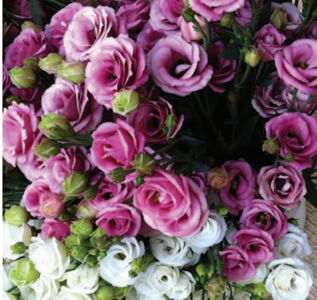
'Doublini Rose Pink' and 'Doublini White'