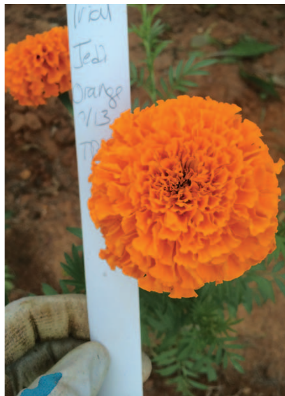
Marigold 'Jedi Orange Plus'

48 inches, could be very interested in a recommendation for a foliage spray with micronutrients to help with strengthening the neck and upper stem area, if we could prevent the broken necks it would be of great benefit, it can be frustrating losing about one third of the stems by the time you get them from the field to home, this is in my mind the biggest challenge with growing marigolds as a cut, also some years spider mites can be challenging as well, however this year was an exception, they (spider mites) were not a problem; I love growing marigolds!; Seed started week 22, transplanted week 28, bloomed week 35, our florists don't usually order marigolds, but we use them in our bouquets for grocers and markets; A very worthwhile marigold, but we still prefer Optiva for straight, single stems in bouquet work; All marigolds become very top heavy with rain, should be staked or netted.