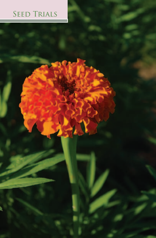
Marigold 'Giant Orange'