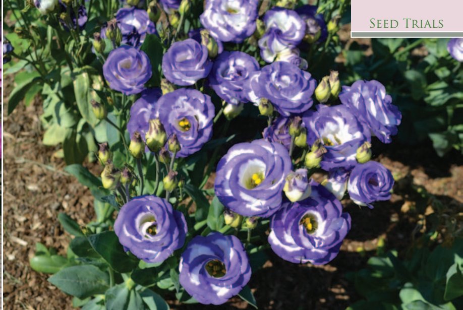
'Rosita 2 Blue Picotee'

size for weddings and wearables; LOVE these! 'Rose Pink' is a slightly more open flower and has more of a garden rose look, Doublinis are perfect for personal flowers (corsages, boutonnieres) and look just like sweetheart roses, most vigorous of three Doublini colors.