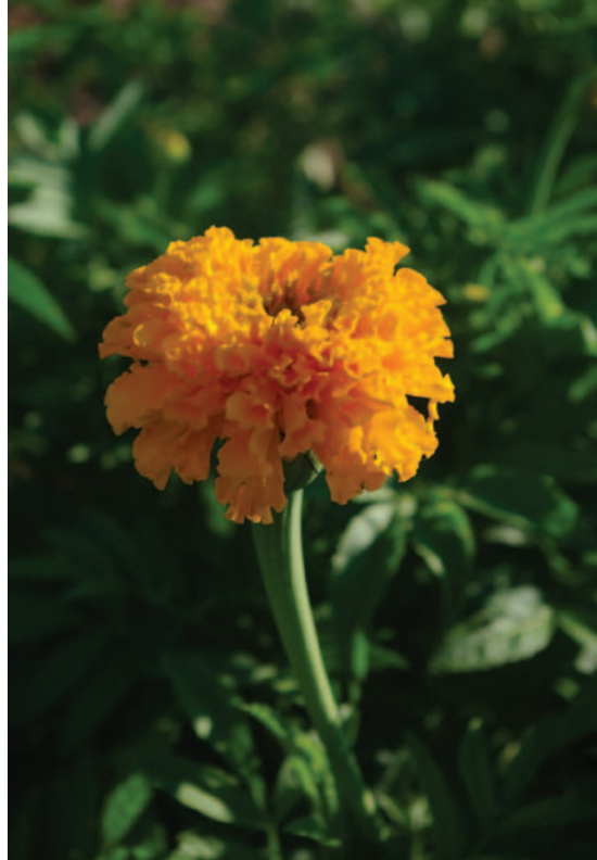
Marigold 'Oriental Deep Gold'