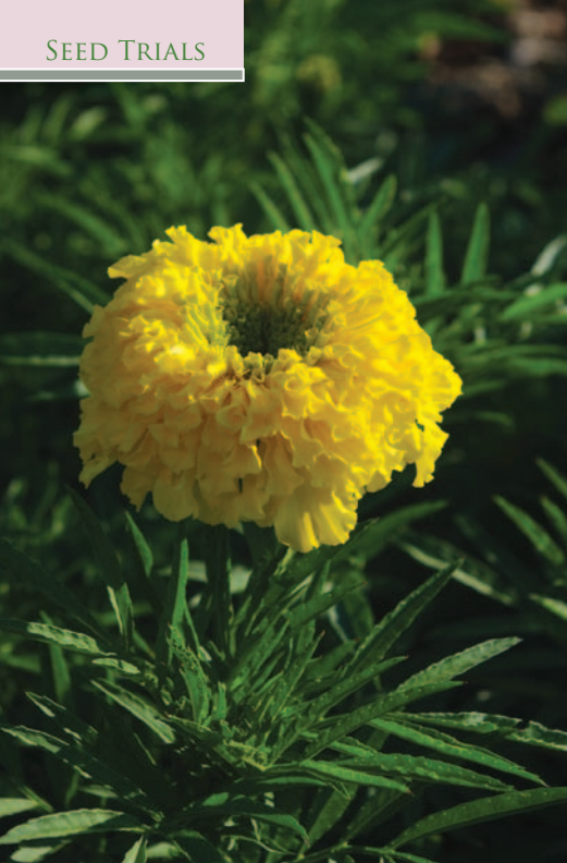
Marigold 'Eagle Yellow'