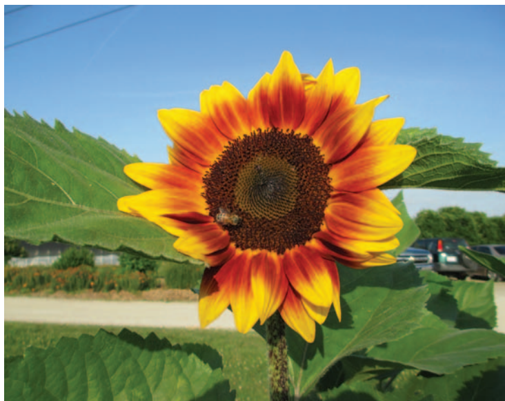
Sunflower 'Helios Flame'

Comments: Beautiful sunflower, customers snapped them up!; Flowers 9 days earlier if given short days in seedling stage, branching stems; I planted these several times, found the later plantings better quality stems and the colour was more acceptable in the fall, germination was excellent,