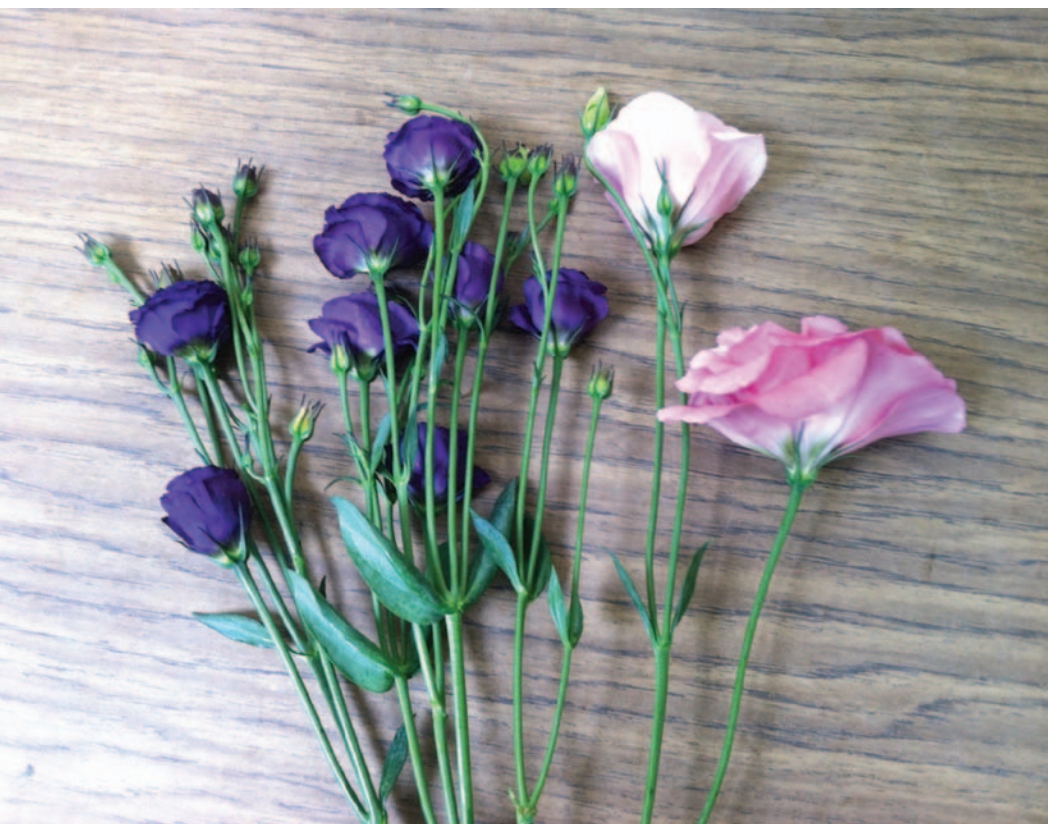
‘Doublini Blue’ (left), Mariachi Pink (right)

Good Qualities: Nice raspberry color (3); Long-lasting flowers either cut or on the plant, abundant small fully double pink tea like rose flowers, gorgeous small pink flowers; Very popular; Multiple small blossoms, long lasting, different from the other lisianthus we grow; Unique small blooms about one inch in diameter; Loved this!! So petite, very dainty; Great for event work; Great