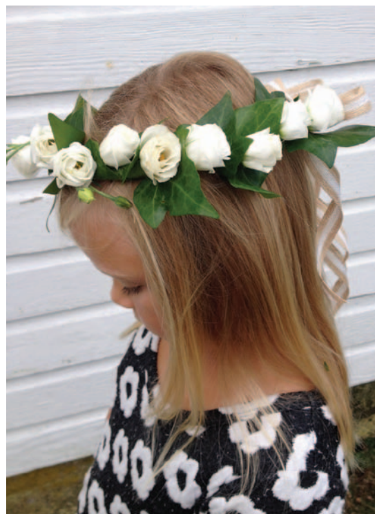
'Doublini White' lisianthus is perfect for floral crowns.