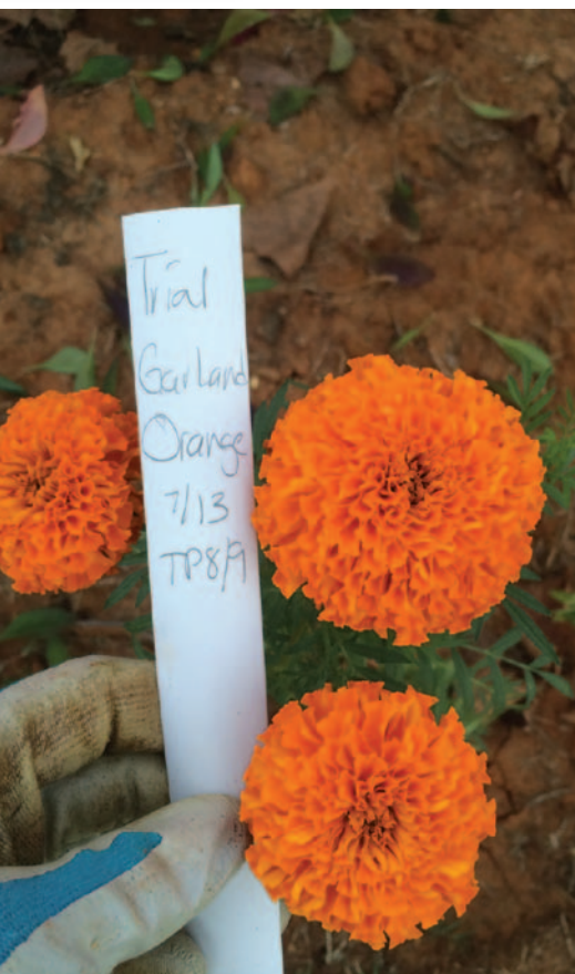
Marigold 'Garland Orange'