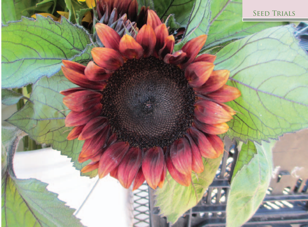
Sunflower 'ProCut Red'

during an extremely wet period when all sunflower stems felt a bit “watery”, but these seemed less sturdy than ‘ProCut Orange’; The golden brown disk turns dingy brown, short.