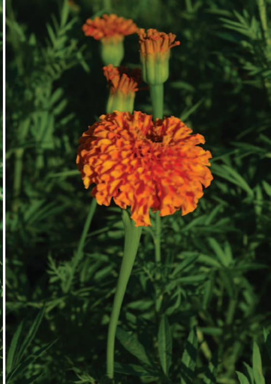
Marigold 'Garland Orange'

shorter than ABC, even though we did not get the number of stems per square foot that we'd like for greenhouse space, we will grow again for customer appreciation, difficult coloration to use in design work—picotee flowers are too “busy” for our work; Second flush stem length around 12 inches—very short; None; Flowers were small, not super showy.