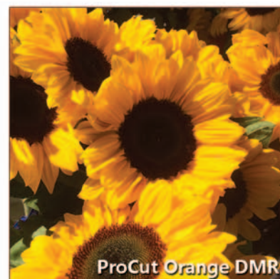
ProCut Orange DMR

ProCut Plum and downy mildew resistant ProCut Orange DMR