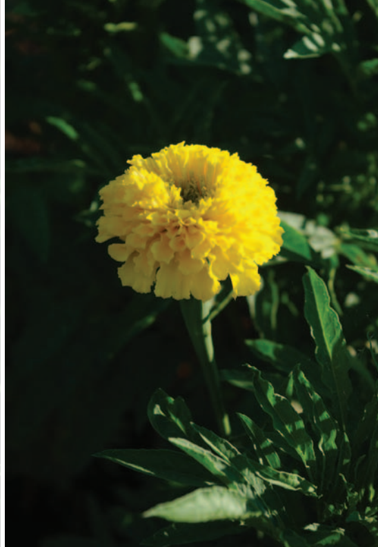
Marigold 'Falcon Yellow'