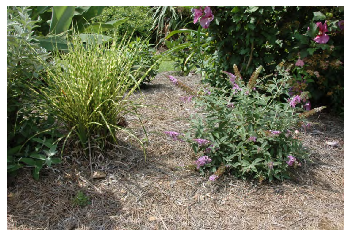
Figure 4. 'Lilac Chip' in a garden setting. Plant shown is 3 years old.