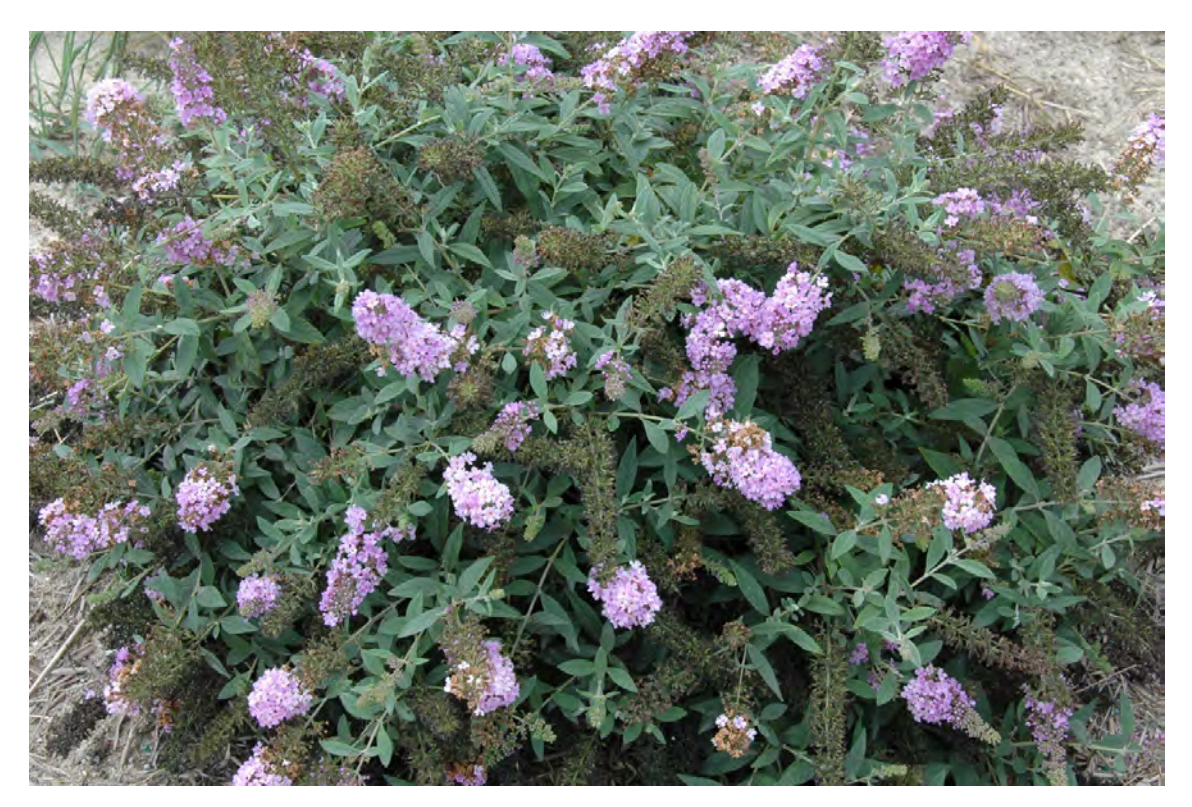
Figure 2. Compact growth and lilac flower color of Buddleja 'Lilac Chip'. Two-year-old plant shown.