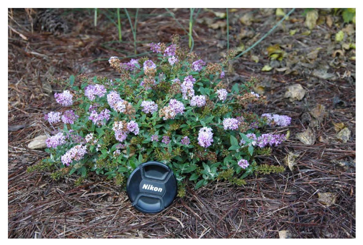
Figure 3. Compact growth of Buddleja 'Lilac Chip'. Plant shown is two years old.