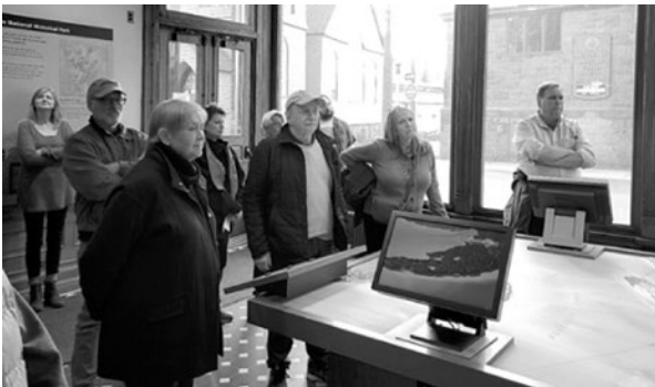
W4001 members at Keweenaw National Historical Park Visitors Center during the 2019 annual meeting.