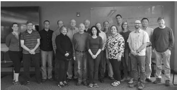
W4001 members at the 2017 annual meeting in Fort Collins, CO.

Other participating institutions include: Brigham Young University, Macalester College, McGill University (Canada), Michigan Tech. University, Middlebury College, University of Mississippi, University of Montana, Syracuse University, University of Texas at San Antonio, USDA ERS