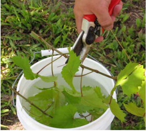
Figure 6. Place the cuttings in water.