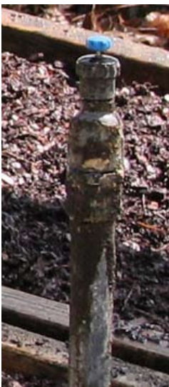
Figure 9. Emitter example.

Step 5. Transport cuttings to a prepared bed and insert the end without leaves into propagation mix. About half of the cutting length should be below the soil – approximately two nodes (Fig. 7). The mix pictured in Figure 7 is a pine bark “blueberry propagation” mix (approximately 1:1:1 peat:sand:bark). Any similar mix with good drainage and aeration would work. The pH of the mix is not as critical as proper drainage, and the mix usually doesn’t require amendments. In general, muscadines prefer a soil pH near 6.0.