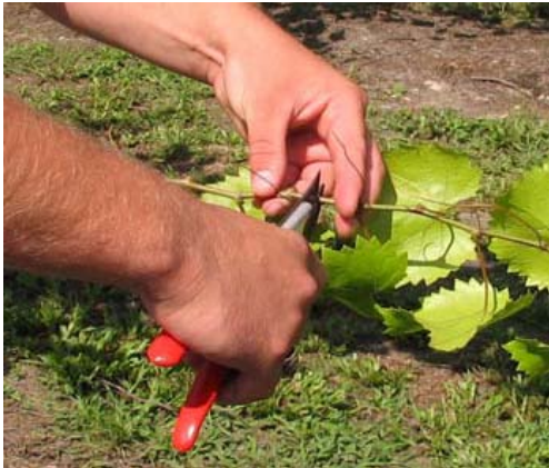
Figure 4. Cut the shoot into node sections.