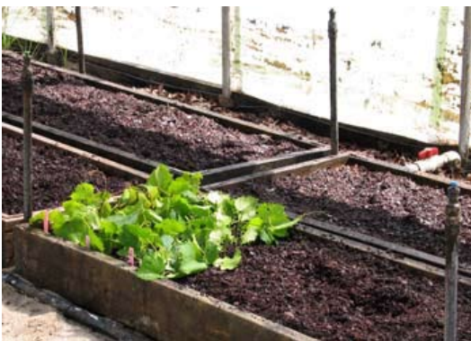
Figure 8. The cutting bed.