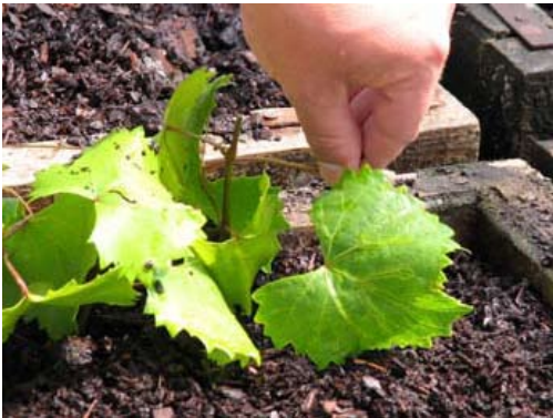
Figure 7. Insert the cutting into propagation mix.