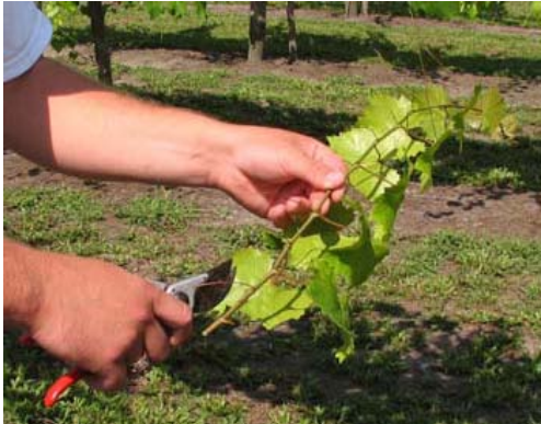
Figure 2. Remove the lower leaves.

Step 4. Immediately place the cuttings in a bucket of room temperature water (Fig. 6). Keep the cuttings moist until they are placed in the cutting bed. Some growers have found it beneficial to cut off half of each remaining leaf to reduce water lost through transpiration.