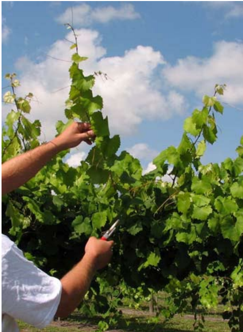
Figure 1. Select a vigorous shoot.

Step 1. Select a vigorous shoot and remove it from the vine. Each “whip” will yield two to four cuttings (Fig. 1).