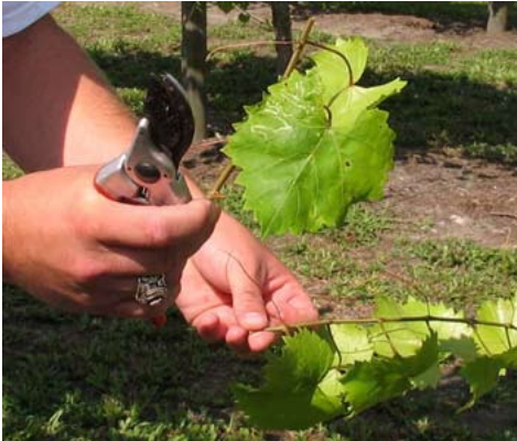
Figure 5. Discard the tender shoot tip.