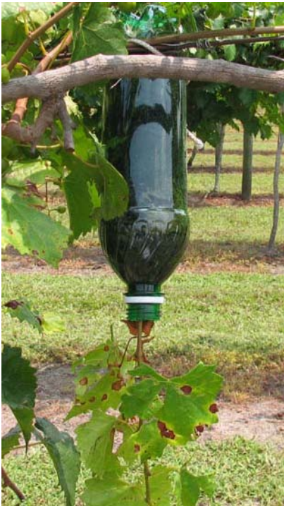
Figure 11. “Air layering” with plastic soda bottles. By fall, roots can be seen at the edge of the bottle.

Rainwater usually suffices to keep the mix wet, but check occasionally and hand water as needed. After the vine goes dormant in the fall, remove the shoot from the parent vine and cut into rooted sections. These can then be potted or stored bare root in a refrigerated area (40°F to 45°F) to await planting the following spring.