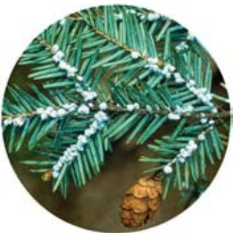
White cottony masses indicate a hemlock woolly adelgid infestation.