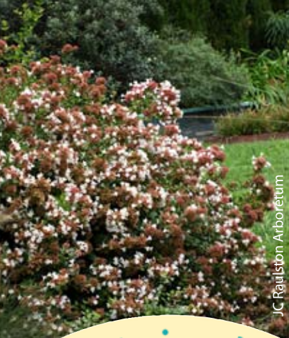
J.C. Raulston Arboretum